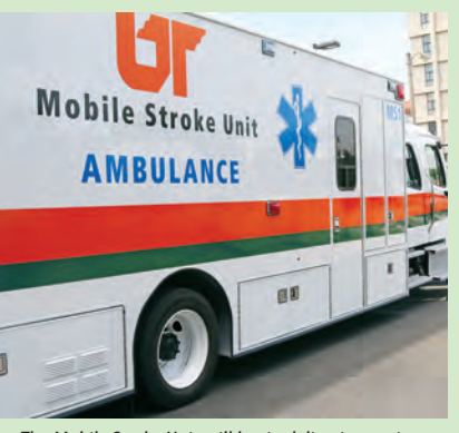
The Mobile Stroke Unit will begin delivering patients to area hospitals this summer.

Stroke is the fifth-leading cause of death and leading cause of disability in the United States according to the American Stroke Association. African Americans have nearly twice the risk of a first-ever stroke and have a much higher death rate. Stroke is particularly prevalent in Memphis' Shelby County, which has a stroke rate 37 percent higher than the national average.