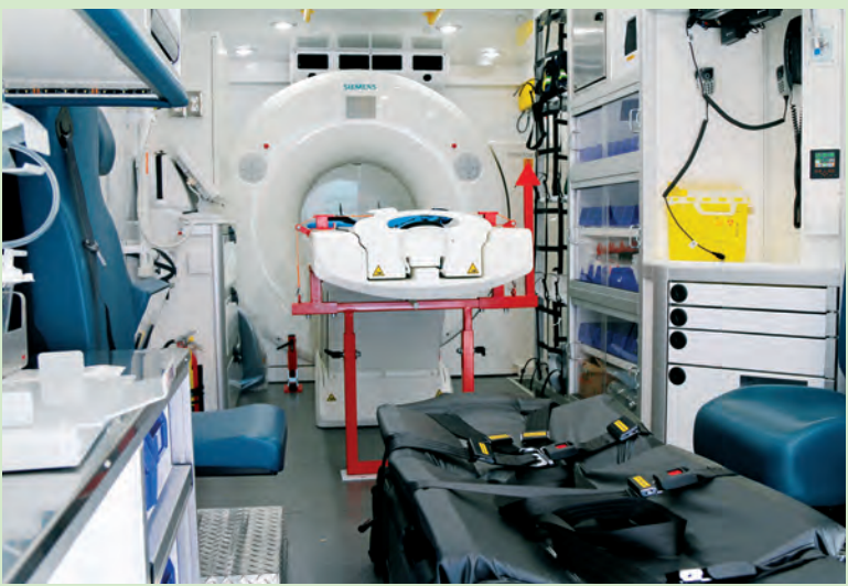
The Mobile Stroke Unit is outfitted with the latest technology, including advanced quality imaging, to help treat strokes.

For the first time, standard stroke care will be available in a mobile setting, creating the ability to diagnose and launch treatment, which can include tissue plasminogen activator (tPA) treatment and the potent blood pressure drug nicardipine within the critical first hour. Some patients may receive endovascular