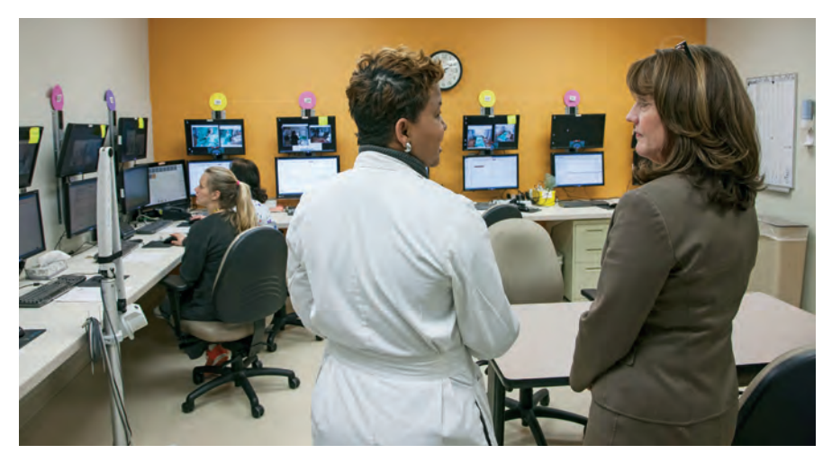
Le Bonheur's Epilepsy Program was recently accredited as a Level 4 Epilepsy Center by the National Association of Epilepsy Centers.

Le Bonheur's Comprehensive Epilepsy Program was recently reaccredited as a Level 4 Epilepsy Center, the highest level, for 2016 - 2017 by the National Association of Epilepsy Centers. To achieve Level 4 status, epilepsy centers must meet certain criteria, including volume of video-EEG monitoring, physician experience and more. Level 4 centers have the professional expertise and facilities to provide the highest-level medical and surgical evaluation and treatment for patients with complex epilepsy.