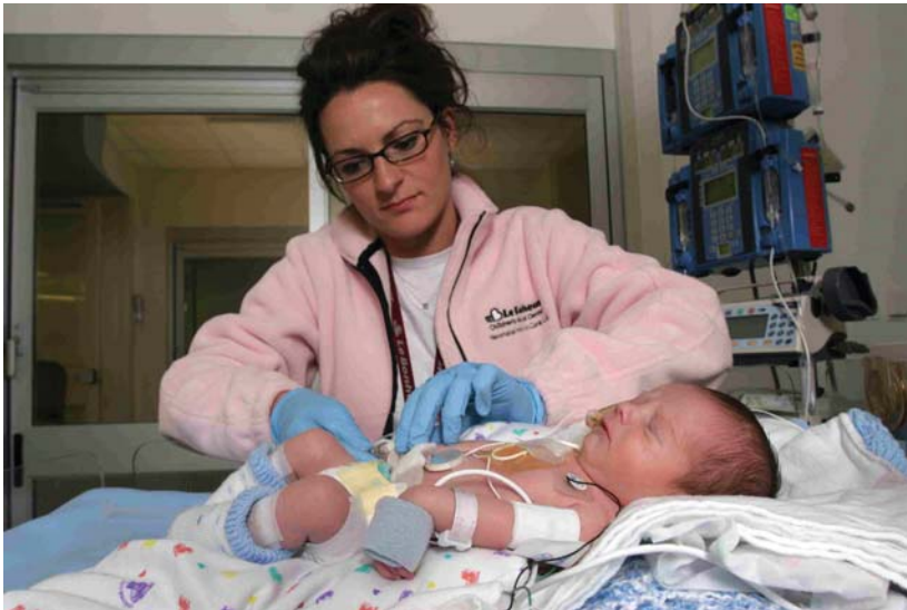
Le Bonheur has asked to expand its neonatal intensive care services to 60 beds in the new hospital. The new Le Bonheur is set to open in 2010.

Le Bonheur Children's has filed a Certificate of Need (CON) application with the Tennessee Health Services and Development Agency to request a 30-bed expansion in its neonatal intensive care services.