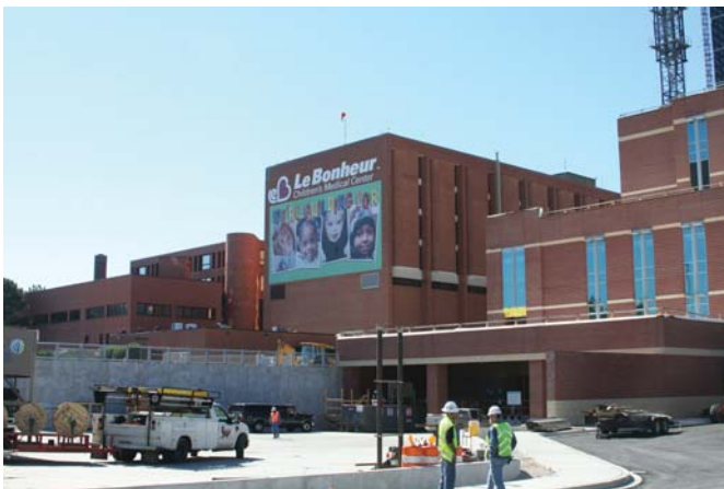
The nearly-completed entrance to the new Le Bonheur's Emergency Department will be located near the corner of Poplar and Pauline.