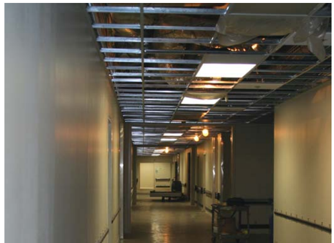
Workers at the new Le Bonheur Children's construction site have moved inside to complete interior work on the new hospital.