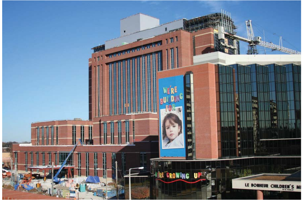
Le Bonheur will hold a Grand Opening for the new hospital on June 15, 2010.

To date, the new Le Bonheur has 2,200 doors on site, 700,000 bricks in place and 710 workers on the construction site.